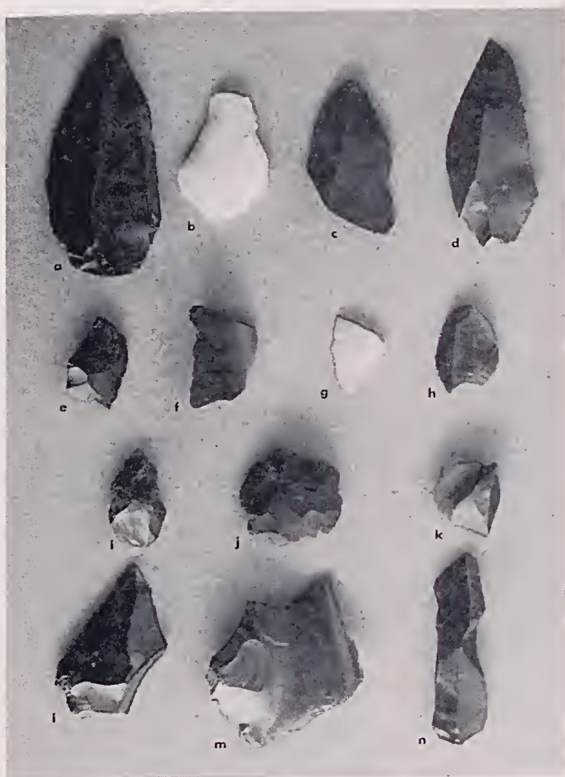
Fig. 3.—Artefacts from the Paraburdoo camp site. (a) biface-type spear point; (b) Pirri-type spear point with broken off point-tip; (c) broken biface-type spear point; (d) biface-type spear point; (e) and (f) cutting-flakes; (g) geometrical microlith; (h) micro-two-side scraper; (i) micro-semi-discoidal scraper; (j) semi-discoidal scraper; (k) noscd scraper; (l) bimarginal point scraper; (m) concave scraper; and (n) one-side scraper. Three fifths natural size.